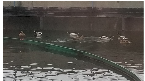
Our favorite visitors!

SCCMUA staff has continued with crane truck repairs; the goal is to maintain a level of service until a replacement can be found. At this time, no safety concerns are noted; the increased size of the newer pumps in these larger stations is nearing the capacity of the current crane's capacity.